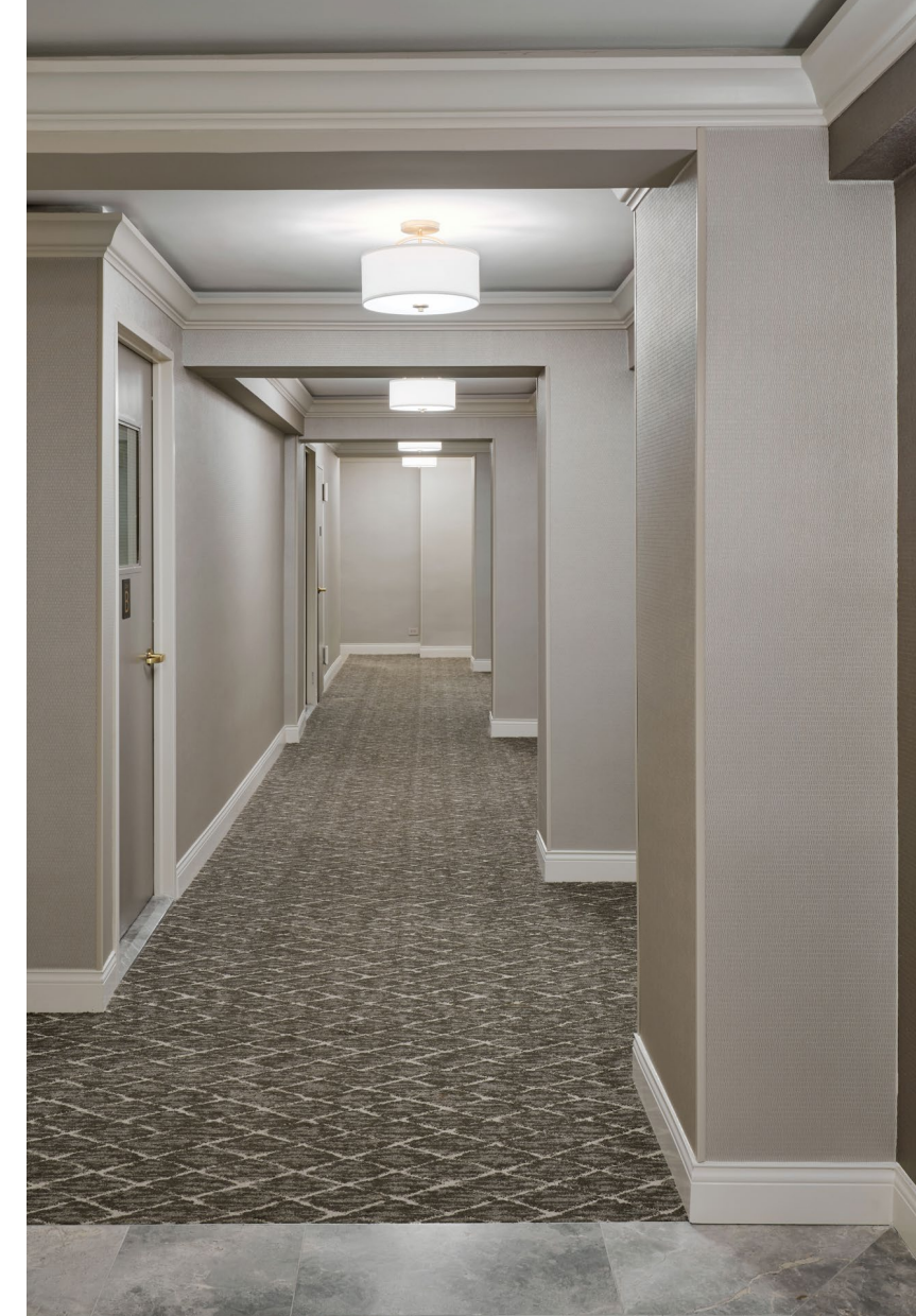
THE REGENCY EAST

PROJECT TYPE: HALLWAY RENOVATION 136 UNITS / 18 STORIES