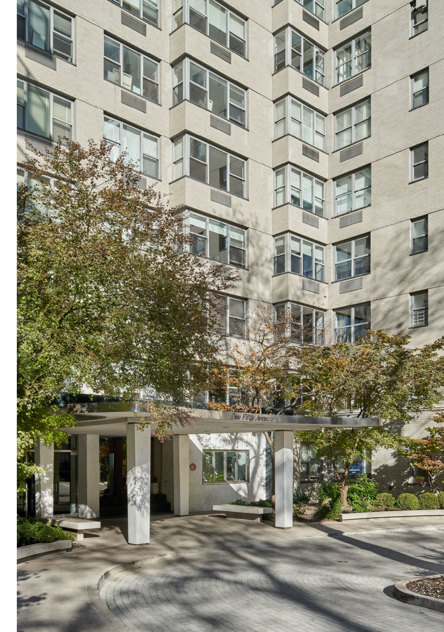
TWO FIFTH AVENUE

PROJECT TYPE: HALLWAY RENOVATION 343 UNITS / 20 STORIES