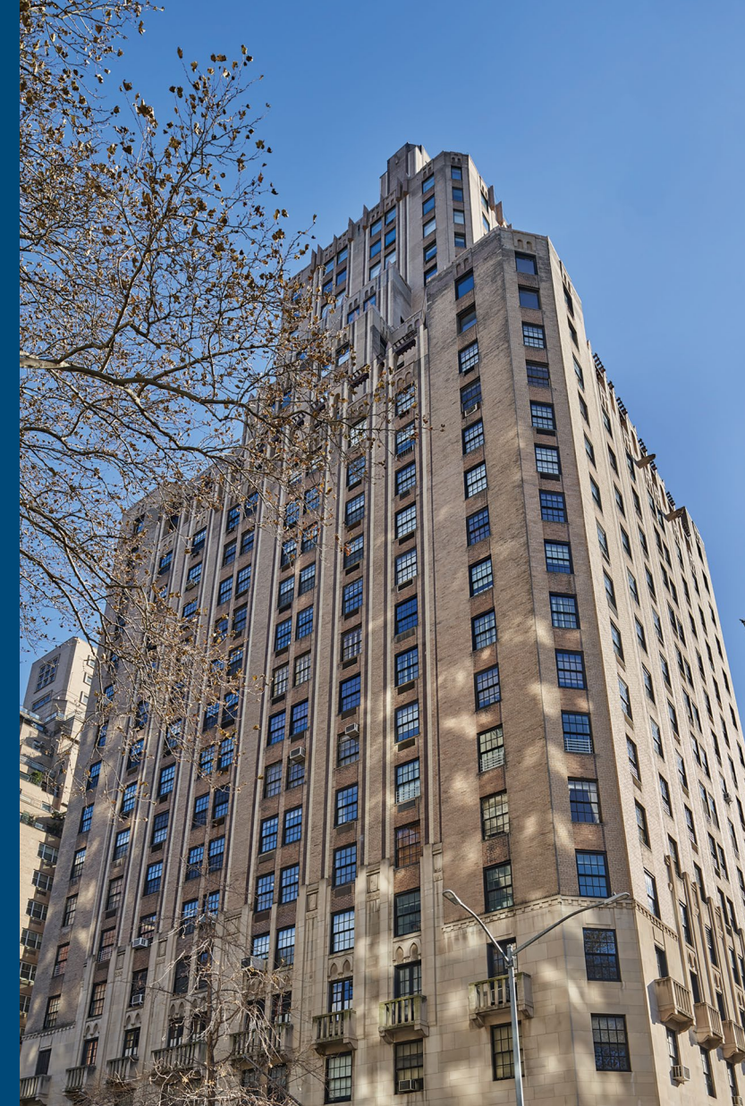
ONE FIFTH AVENUE

PROJECT TYPE: HALLWAY RENOVATION 198 UNITS / 27 STORIES